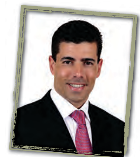
SPEAKER JOSE OLIVA

Participants are assigned to House committees and subcommittees, and leadership offices. Under the guidance of senior House staff, assignments may include research, bill drafting and analysis, oversight activities, and other tasks relating to policy or fiscal areas.